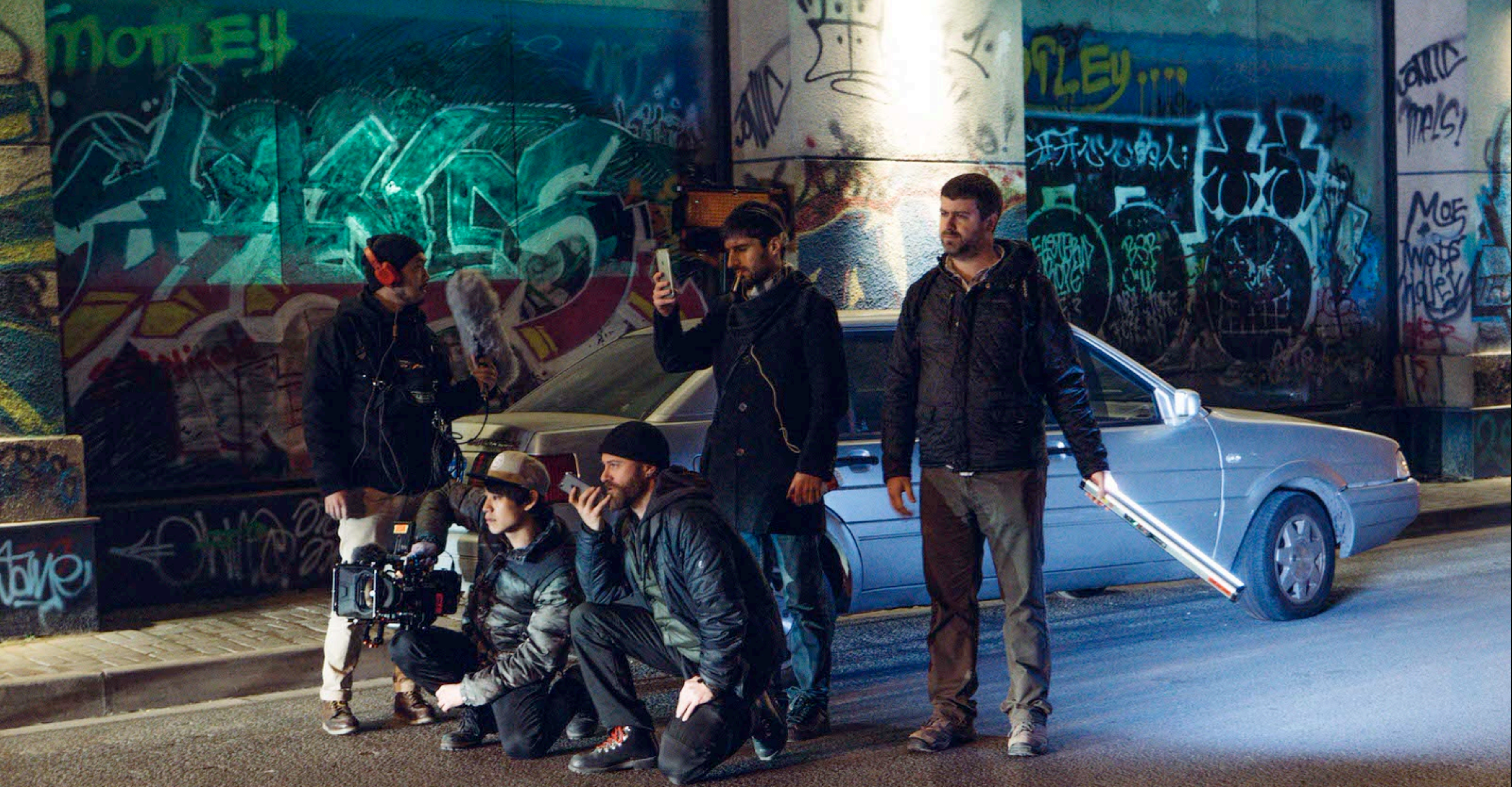
THE PASSPORT MOVIE PRESSKIT